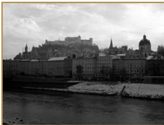
Snowy Salzburg: home to several events during the Mozart year 2006