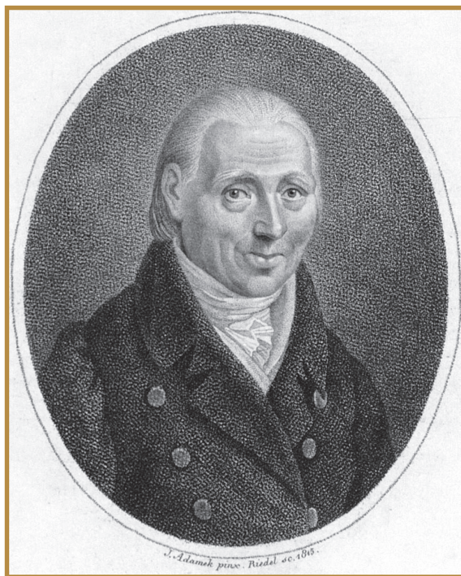
Johann Baptist Wanhal

After graduating in 1941, a position in the US Signal Corps Band at Fort Monmouth, New Jersey, beckoned. For four years, I