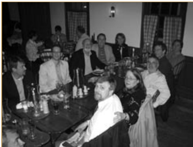
Members and guests of SECM enjoy dinner at historic Christiana Campbell's Tavern.