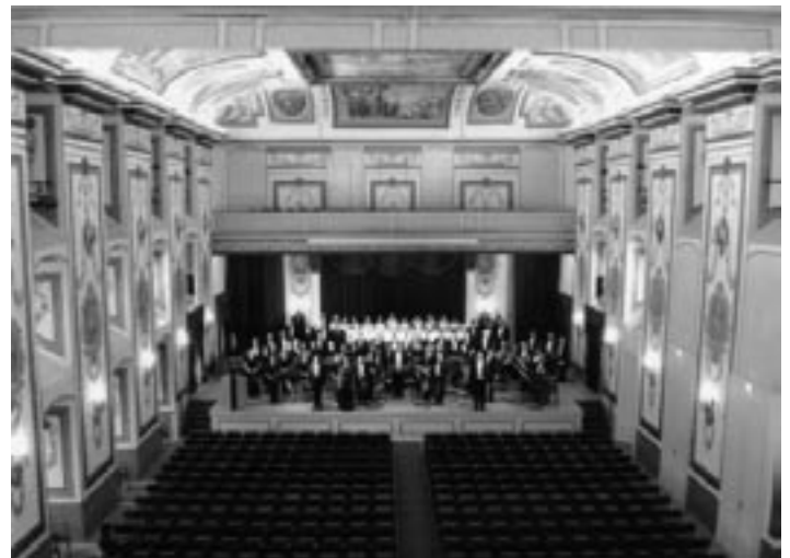
Eisenstadt Classical Music Festival. Inside the Haydnsaal of Schloß Esterházy.