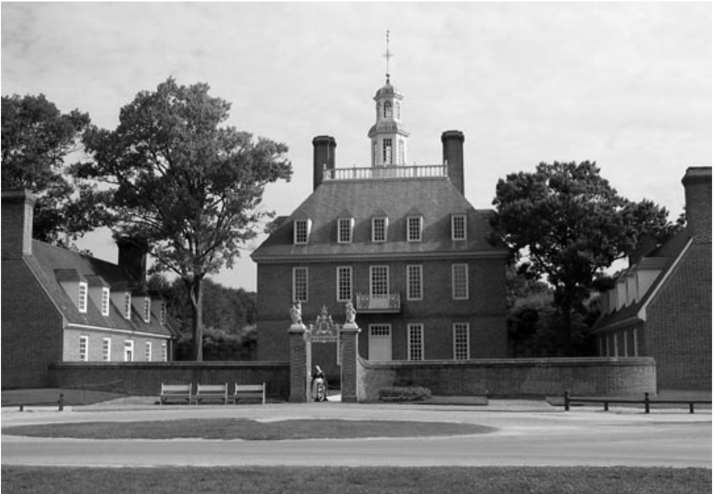
The Governor’s Mansion, one of many historic buildings in Colonial Williamsburg—site of SECM’s second biennial conference in April